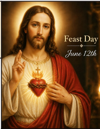
Feast Day June 12th

Sacrificial Giving – May 23-23. Offertory $ 4,687.00 Online Giving $ 4,257.00 Monthly loan payment: $24,983.51 Remember St Patrick In Your Will