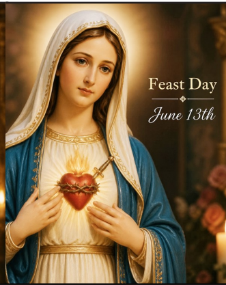
Feast Day June 13th