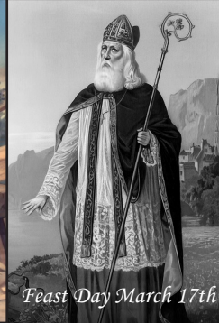
Feast Day March 17th