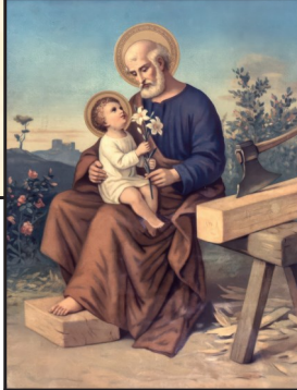
St Joseph, spouse of the Blessed Virgin Mary Feast Day March 19

How often do we invest our time, talent and treasure in creating an appearance that does not matter at all to God? We strive to impress with our clothing, home, career, possessions, car and other marks of distinction. But none of these illusions of greatness will impress God. Instead, He will look into our hearts to see how much we loved Him, how much we loved others and how we showed that love by the way we used our time, talent and treasure here on earth.