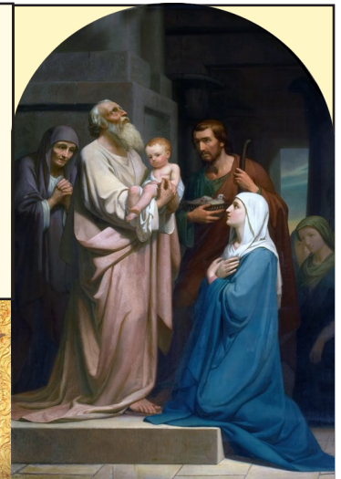
The Presentation Of The Lord February 2nd