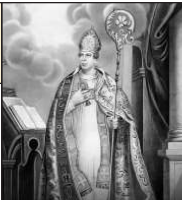
Saint John Neumann PRAY FOR US

Feast Day January 5 Father of the American Parochial School System