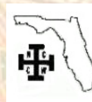
FCCW – Florida Council of Catholic Women