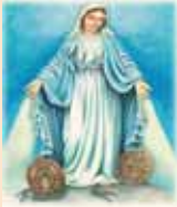
Miraculous Medal Novena Tuesday morning after Mass